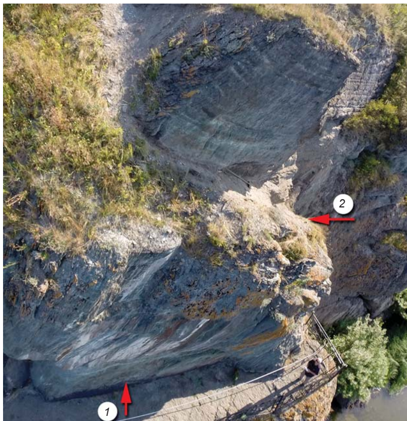
Fig. 1. Tomskaya Pisanitsa.

1 – plane with rock art representations; 2 – place where the figurine of the horse/onager was found.