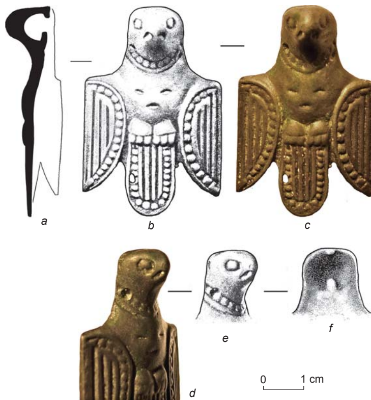
Fig. 5. Ornithomorphic pendant. a, b, e, f – drawing; c, d – photo; a – longitudinal cross-section at the center; b, c – face view; d, e – profile view of the upper part; f – back side of the upper part.

Ornithomorphic pendant. It was found in 1991 at the foot of the rock near the drawings of the second group by