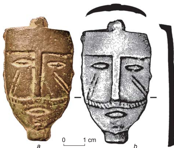
Fig. 4. Anthropomorphic mask with truncated top. a – photo; b – drawing.

The eyes and mouth are shown as isomorphic horizontal ellipses with unfilled inner space. Pairs of diagonal lines run