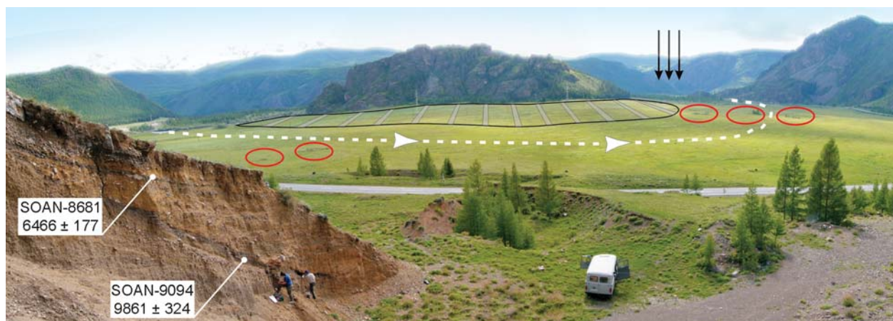
Fig. 2. The Chuya valley in the Baratal mouth.

Black arrows show the location of the glacial dam; stripes indicate Late Neopleistocene lacustrine sediments preserved around the bedrock exposures; white dashed line with arrows shows location of bed and direction of current of the pre-Chuya; red ovals show mounds of the Baratal-1 Pazyryk cemetery. Calibrated ( 2\sigma ) radiocarbon dates characterize the age of paleosols at the right valley shoulder. The altitude is 1470 m a.s.l.