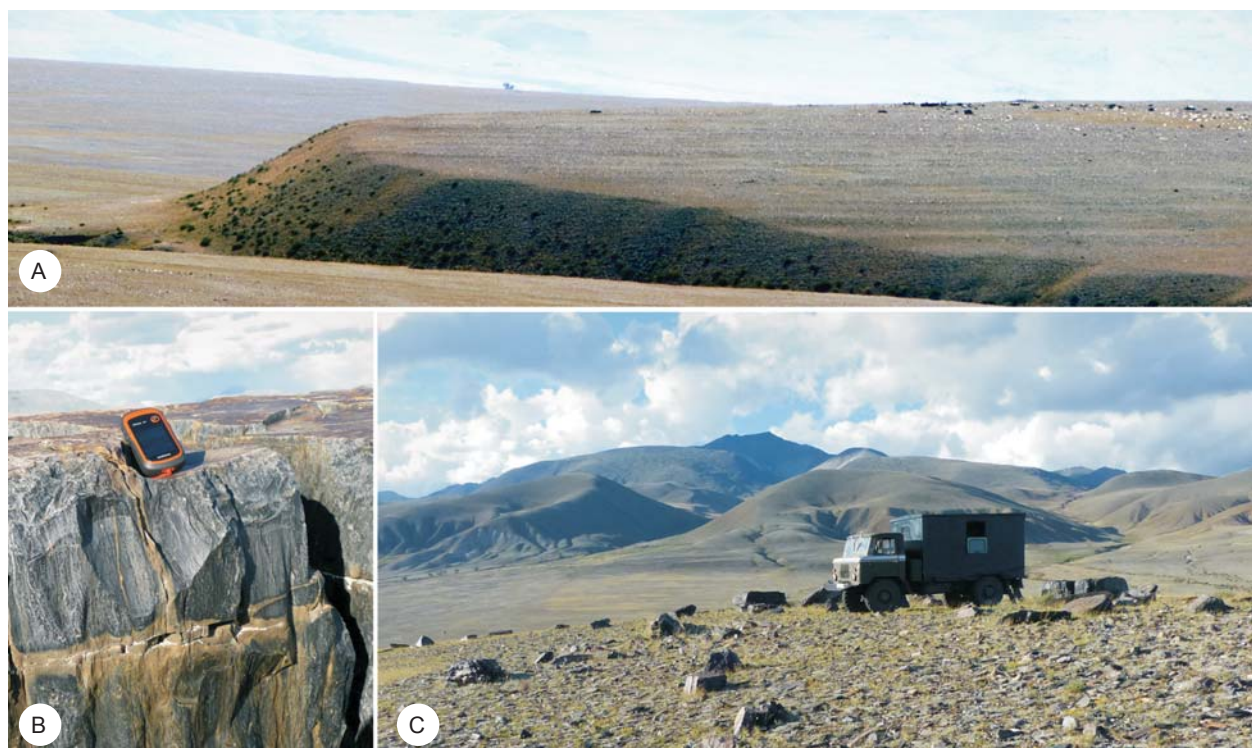
Fig. 2. Late Paleolithic site of Bigdon.

A – lake terraces simulating the surface of piedmont proluvial cone where the site is located; B, C – dropstones (as can be seen clearly in photograph B, the fragments are not the products of destruction of bed-rocks, which do not crop out in this part of the Chuya basin).